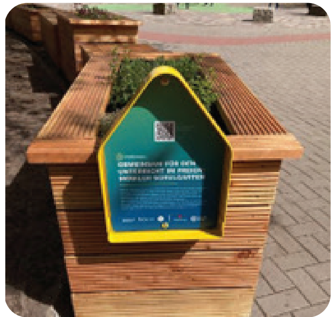
Mobile garden solutions (Grundschule Neugraben, 2022)

The project focused on creating moveable raised beds, seats, and storage containers for three schools to be used in the schoolyards. The restructuring measures were co-created with the involvement of pupils. The project was realized through a novel collaboration between the local partners of the CLEVER Cities project, school officials, pupils, and the parents' council. The raised beds and benches were made through a guided workshop by a local carpenter, with participation from the school pupils. As a result, the schools gained four raised beds and four storage benches, and the construction manuals were revised to be used as a replication tool.