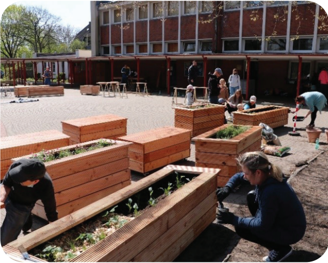
Implementation of the mobile garden solutions in Hamburg (steg mbH, 2022)

ple's attention and integrate them into the development processes, such as in the Hamburg case (see Arlati et al., 2021). Moreover, a multifaceted approach was deployed in London, which included continuous engagement through events, social activities, and get-togethers, keeping online channels open even after the co-design phase – beside the incentive-based participatory programme supporting the continuous engagement of key stakeholder groups i.e., civil society and project area residents. Similar approaches were also employed in Hamburg and Milan (see Mahmoud & Morello, 2021). Overall, the co-design of NbS involved a flexible approach in selecting and deploying various participatory tools, considering the unique framework conditions of each project area.