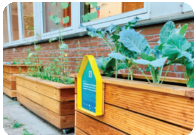
Mobile garden solutions (steg mbH, 2022)