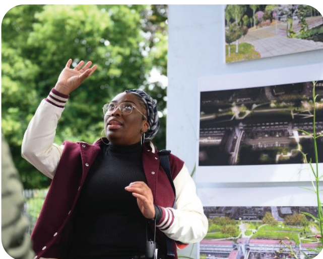
Community co-design event in South Thamesmead London (Heald, 2021)

The co-design of NbS also involved the deployment of various participation tools across the three cases. Based on the tools' catalogue provided in advance to the local project teams through the CLEVER Co-creation Guidance (Morello et al., 2018b), the CLEVER Cities experiences showed that the main factors informing the choice of tools were: cost-effectiveness; characteristics of the stakeholders; and, existing participation practices from the local contexts.