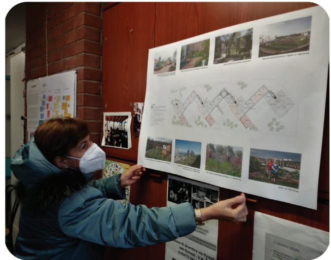
Co-design activity with the residents of the towers of via Russoli (RiceHouse srl., 2021)

While other framework variables such as local policies and regulations had minimal impact on the choice of participation tools, the engagement of public agencies and other key stakeholders as part of local project teams was vital in legitimizing the selection of the tools. This way, novel participation tools were piloted as an answer to the various framework conditions of each NbS project. For instance, beside the communication and awareness rising campaigns, the London project team relied extensively on an incentive-based participatory approach through the establishment of the representative boards of civil society from the project area, a crucial measure to overcome the pre-existing context of scattered representative organizations of local communities and residents’ general apathy and lack of trust towards public authorities.