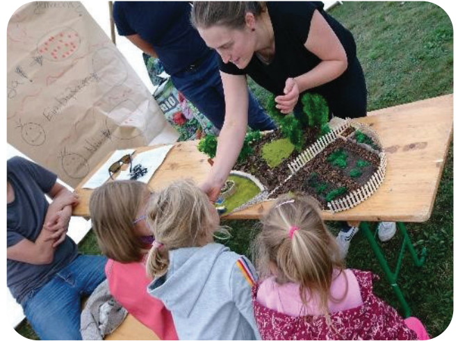
Co-designing the school garden model with the pupils in Hamburg (steg mbH, 2019)

Engaging stakeholders in co-design processes presented also unique and common challenges across the three cases. In London's experience, the main burden in these regards was the pre-existing context of scattered