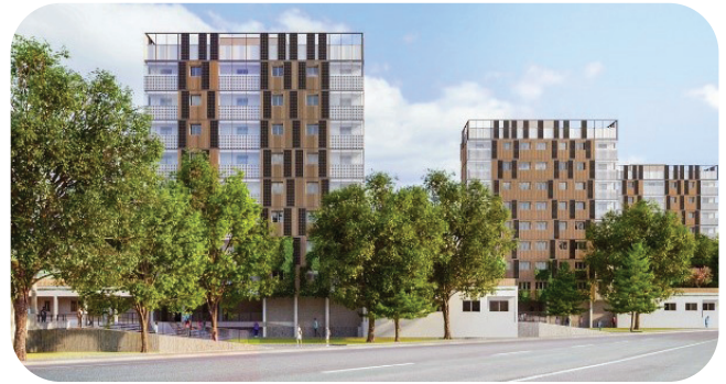
The rendering of the green roofs and walls of the towers of via Russoli (RiceHouse srl., 2021)