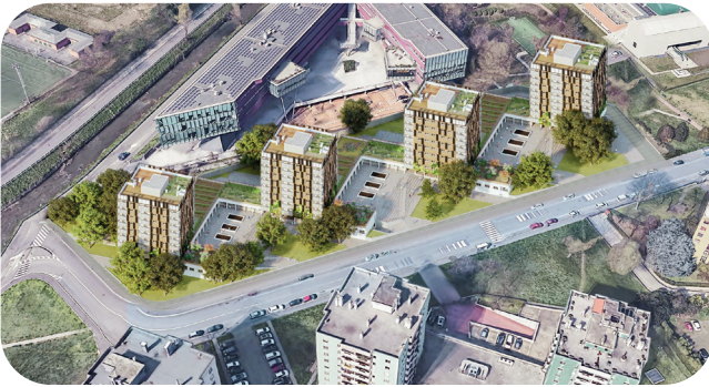
The rendering of the green roofs and walls of the towers of via Russoli (RiceHouse srl., 2021)

aimed to promote the practicality and usefulness of NbS in urban areas and serve as an example for others to follow.